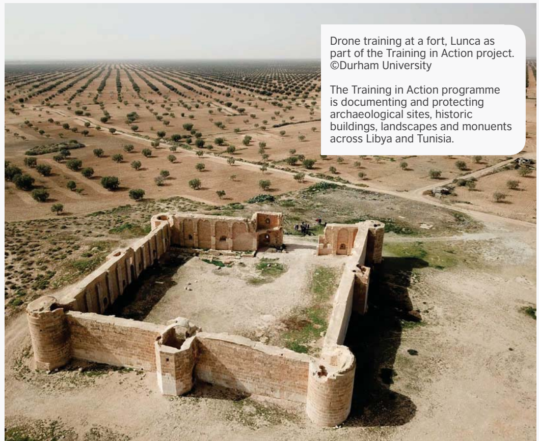
Drone training at a fort, Lunca as part of the Training in Action project.

Other relevant SDGs: 4, 5, 8, 10, 16, 17.