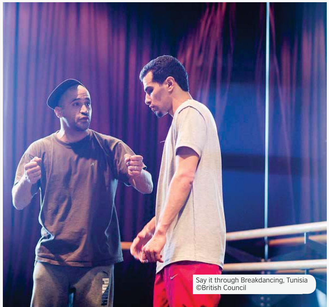
Say it through Breakdancing, Tunisia

Other relevant SDGs: 1, 4, 5, 11, 16, 17.